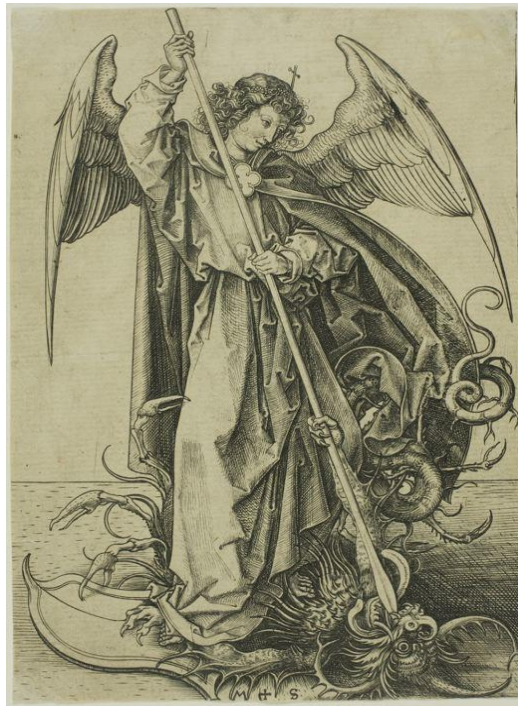
Martin Schongauer German, c. 1450-1491